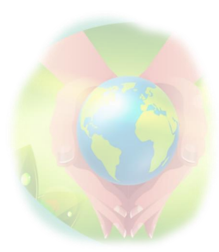
"Our planet is our home, our only home. Where shall we go if we destroy it?"

Module 2 aims to professionally accompany the client on the path to business start-up within the framework of the AVGS. This module can be obtained for up to 6 months under the title "start-up counselling" (80 units). Our experience shows that this is a reasonable amount of time for managing many of the challenges that arise together with you.